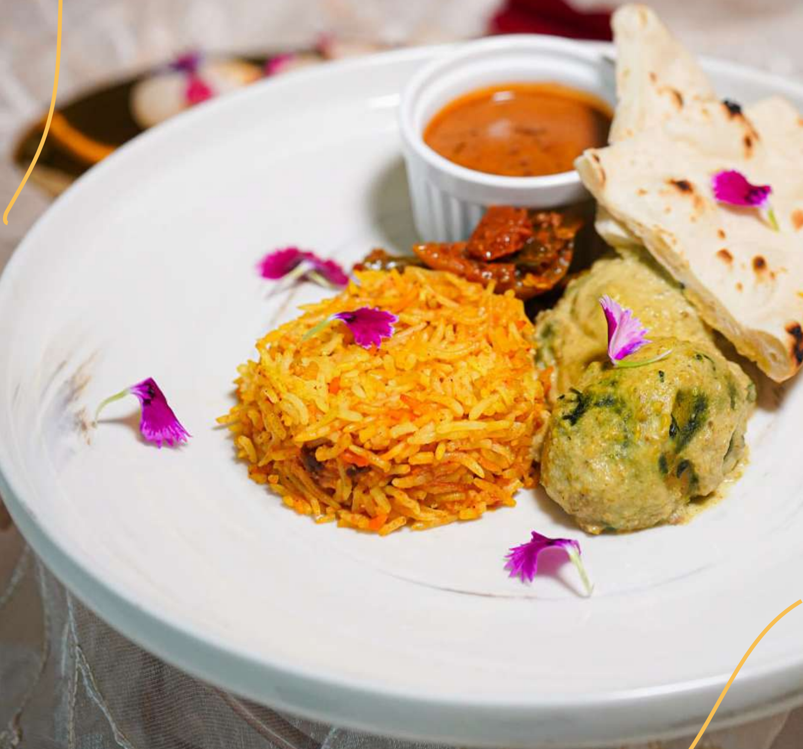
Spinach Kofta Dumpling in Fennel Cashew Sauce