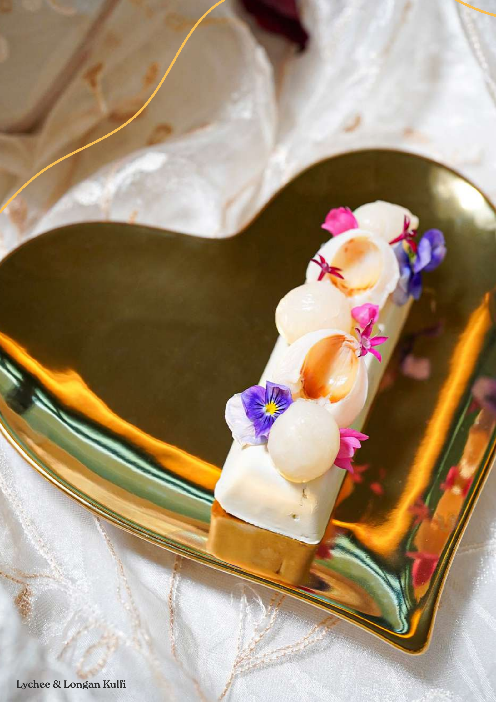
Lychee & Longan Kulfi