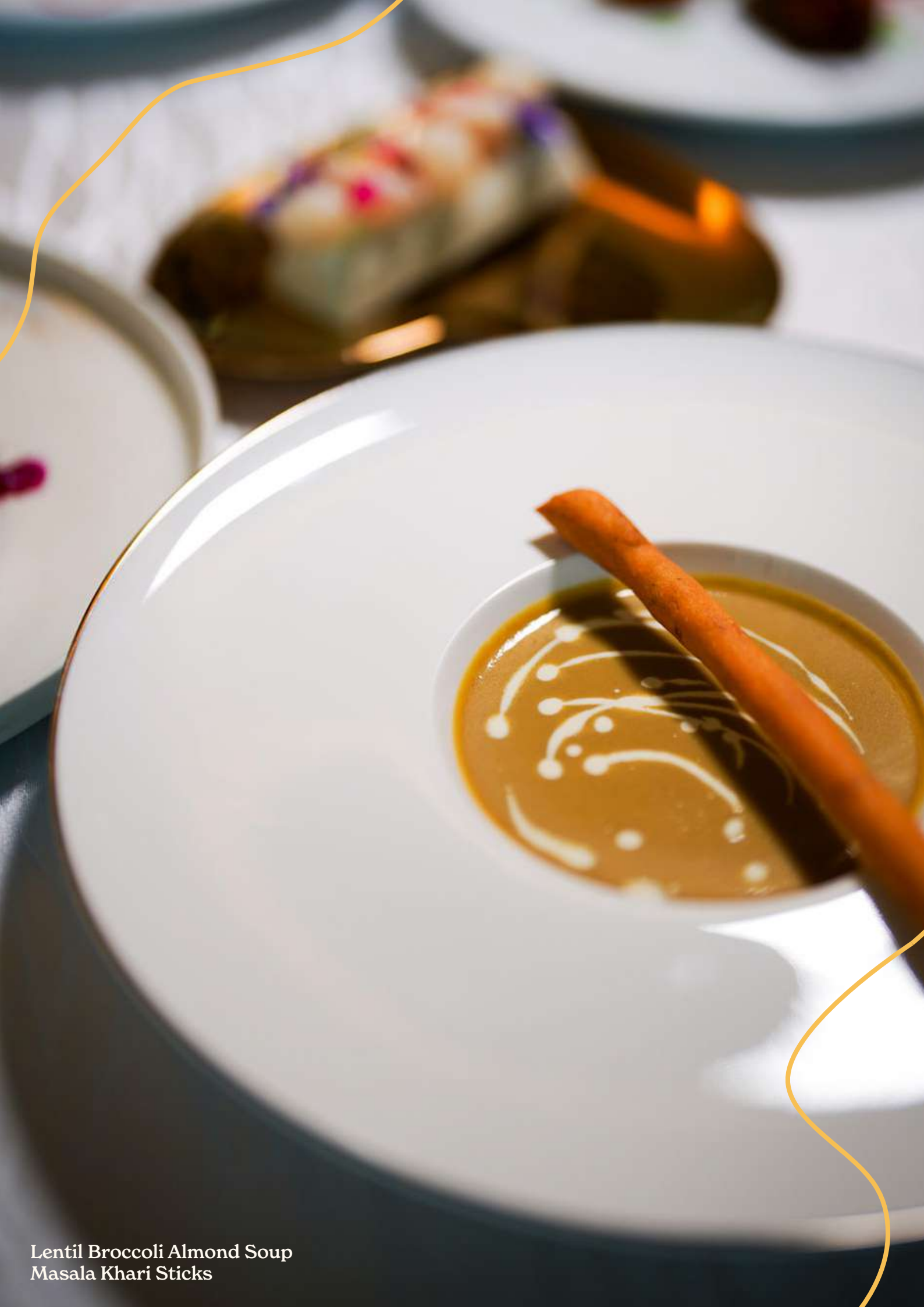
Lentil Broccoli Almond Soup Masala Khari Sticks